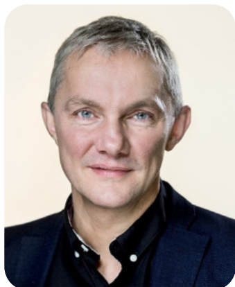
• Sjúrdur Skaale Member of The Danish Parliament (Javnaðarflokkurin) sjurdur.skaale@ft.dk