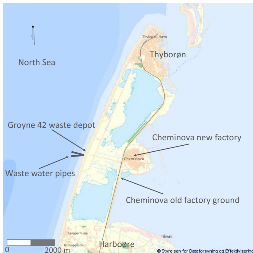
Figure 2. Detailed map of Thyborøn-Harboøre. Background map used with permission from The Danish Agency for Data Supply and Efficiency and adapted with details from 4 .

From the Thyborøn-Harboøre population, we formed two cohorts. First, persons living in Thyborøn-Harboøre at the height of the chemical pollution in 1968–1970. Second, newcomers to Thyborøn-Harboøre in 1990–2006 after the release of chemicals to the environment came under control from the end of the 1980s.