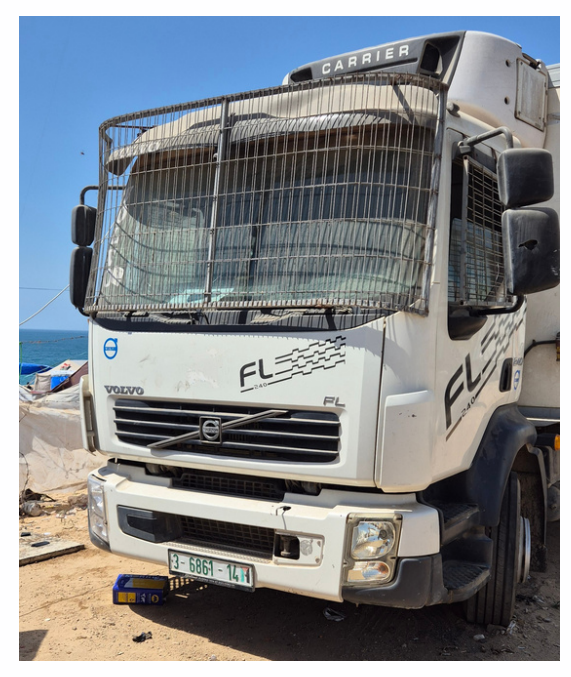
The few aid trucks that do enter Gaza face the risk of looting and must be equipped with protective cages around windows and lights due to the increasing desperation of the local population facing starvation and death.

According to the UN, of the <a href="https://doi.org/10.10/10.10/">115 humanitarian missions planned</a> for northern Gaza in June, only 53 (46%) were facilitated by Israeli authorities. Additionally, 41 missions (35.7%) faced impediments, 11 (9.6%) were outright denied access, and 10 (8.7%) were canceled due to logistical, operational, or security concerns. Movement between Gaza's North and South is also particularly challenging due to the checkpoints and holding points along the Israeli military's Netzarim corridor, which segments the enclave, compounded by persistent fighting and insecurity, including the following: